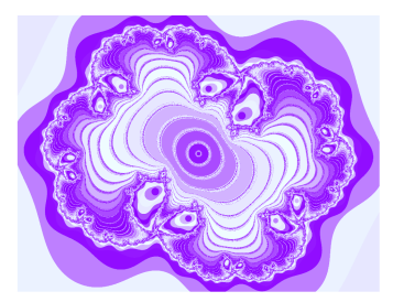
FIGURE 1.2. The Julia set of z^2/(1+cz^2)+p/z^{10} with p=10^{-7} and c in the 'rabbit' component of the Mandelbrot set. Each Julia component is either a circle or a covering of the Julia set of the quadratic polynomial z^2+c .